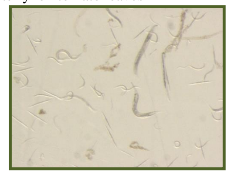
S.feltiae isolated from the body of scale