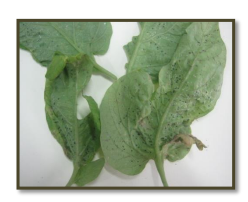
Development of Encarsia in greenhouse whitefly on tomato leaves