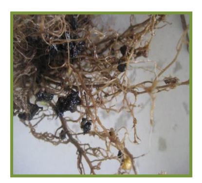
The action of Fuzarium oxysporum subsp. Orthoceras on the haustories of parasite plant, the sunflower broomrape, Orobnche cumana