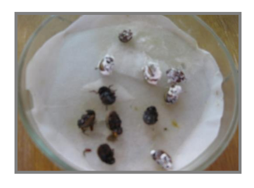
The isolated S. feltiae from L.botrana