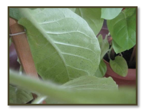
Rearing of Encarsia on tobacco plant of pot culture in laboratory